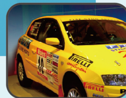
▶ PVC Vinyl / Window Tint Film/Paint Protection Film