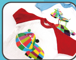
▶ Heat Transfer Film