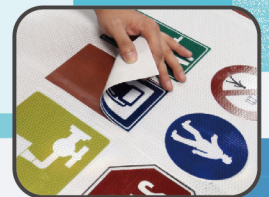
▶ Reflective Film / Sandblast Film